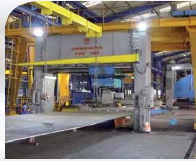
Press brake 700T