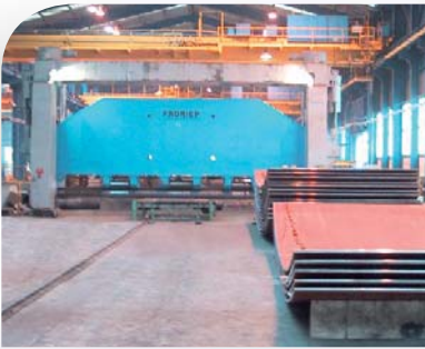
Cold rolling crushing machine 1500T