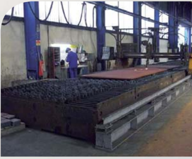
3 digitally-controlled oxygen cutting machines