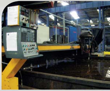
1 plasma cutting under water