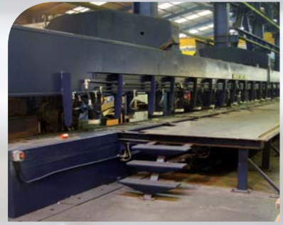
Cold rolling crushing machine