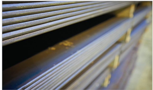
Medium thickness plates ( 8 -20 mm / .315" - .79")

Our product are delivered with a guaranteed flatness ≤ 3mm/m (1/8" in every 40"). 95% of plates are delivered with a typical flatness ≤ 1.5 mm/m (1/16" in every 40").