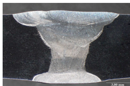
Micrographic view of a UR™ 32615 welded sample

Our research center can provide technical assistance for welding and forming of UR™ 32615.