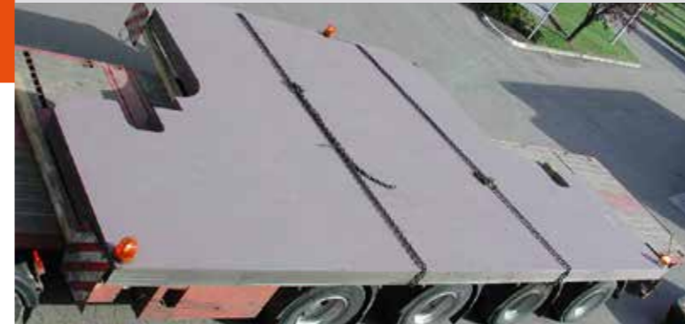
Frame for press brake Thickness: 200 mm - Grade: S355 - Shipping weight: 42 t