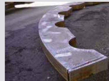
Bottom and upper ring segment for hydroelectric turbines Thickness: 200 mm Outside diameter : 12760 mm Grade: S355 Weight : 20 t