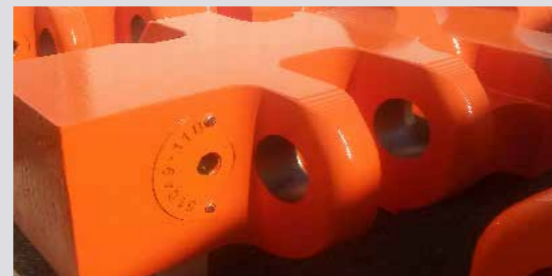
Trackpad for rope shovel Thickness: 400 mm- Grade: Mecasteel 145