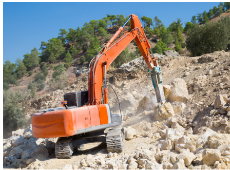
Excavator mounted with hydraulic breaker