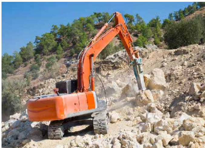
Excavator mounted with hydraulic breaker