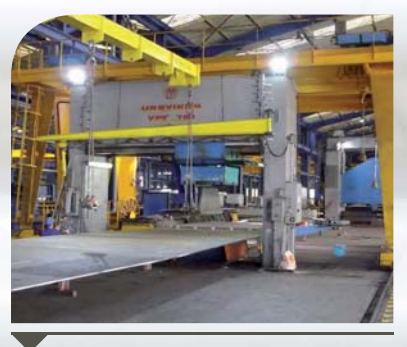
Press brake 700T