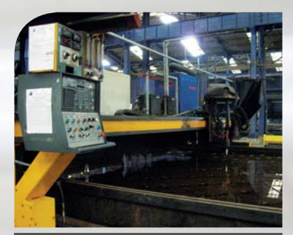
1 plasma cutting under water