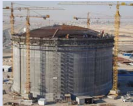
LNG tank under construction for RasGas co Ltd by AMI in Qatar